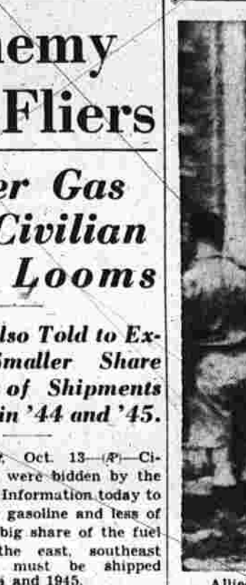
Allied soldiers rush into the area about the Naples post office after explosion of a gigantic Nazi time-mine Oct. 7, killing scores of civilians and several Allied soldiers. Note dazed man at right, still lying where he was knocked by the blast. (AP Wirephoto via Signal Corps radio).

MANCHESTER, CONN., WEDNESDAY, OCTOBER 13, 1943 (SIXTEEN PAGES) PRICE THREE CENTS